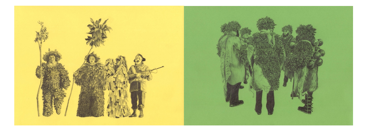
'La cinquième saison, Acte I #3 and #4' by Céline Marin, 2020, pencil on coloured paper, 21x 29,7cm

The first part or Act I of 'The Fifth Season' series (2019-2020) consists of graphite drawings featuring figures of wild men, bears, bell-ringers and other surprising characters with special clothes and masks or astonishing headdresses topped with miniature scenery. Céline Marin reconfigured a selection of single participants, with special attention to the postures and costumes to create intruiging scenes. Whereas in this first subseries Marin distinguished the specific village scenes, e.g by using a specific background colour, she draws in the second part an imaginary collection of bizarre masquerades.